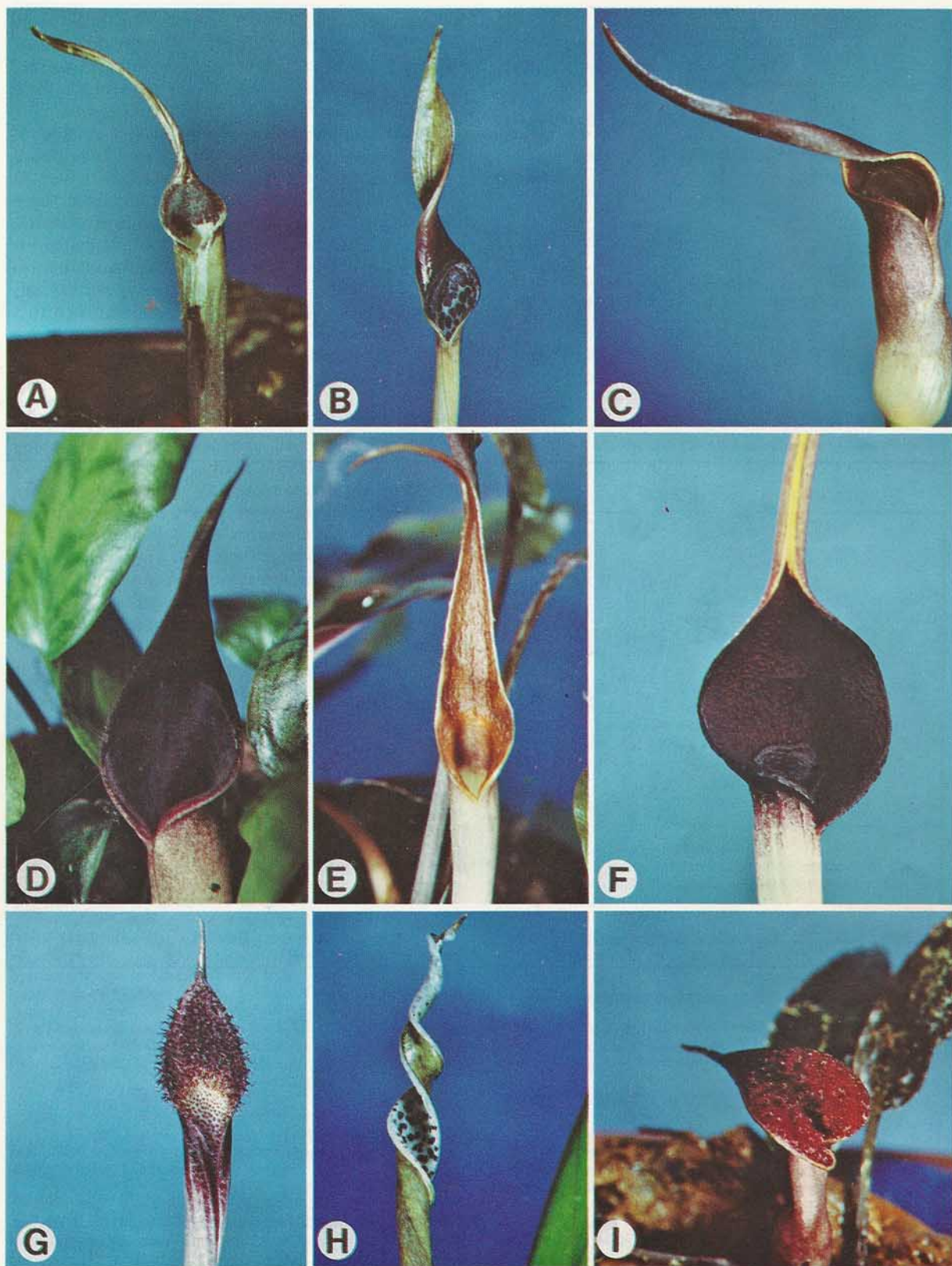
Fig. 2. A. Cryptocoryne striolata (NJ 78-52). - B. C. nevillii (NJ 3093). - C. C. moehlmannii (NJ 3088). - D. C. auriculata (NJ 78-6). - E. C. zukalii (NJ 3162). - F. C. longicauda (NJ 78-21). - G. C. villosa (NJ 3107). - H. C. retrospiralis (NJ 3126). - I. C. nurii (NJ 78-62). All \times 2 .